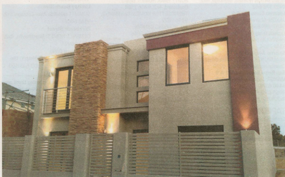
This home in Victoria Park was custom-designed and makes great use of space.