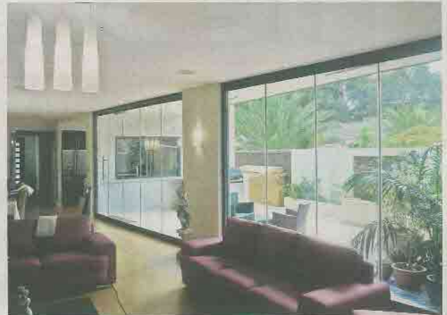
The open-plan living area looks out to an alfresco area with a built-in barbecue.

FREECALL 1800 149 365 - Michael Cardiner www.perceptions.com.au