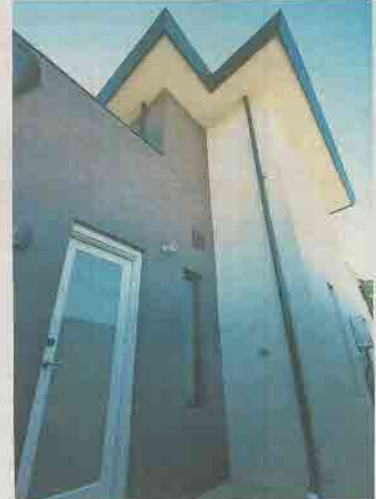
This home was an entry in the 2010 HIA-NAB Perth Housing Awards.